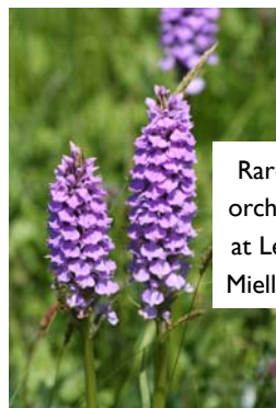
Rare orchid at Les Mielles