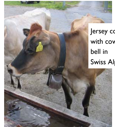
Jersey cow with cow bell in Swiss Alps