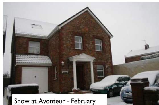
Snow at Avonteur - February