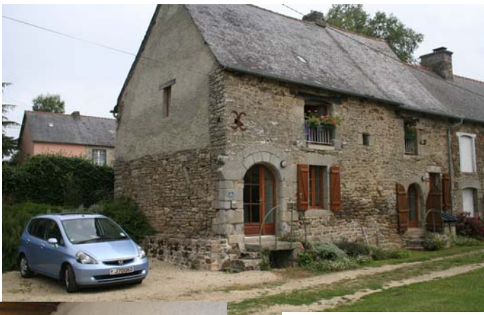
Our French gite at Trevron