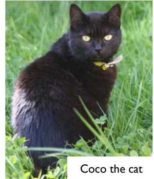
Coco the cat