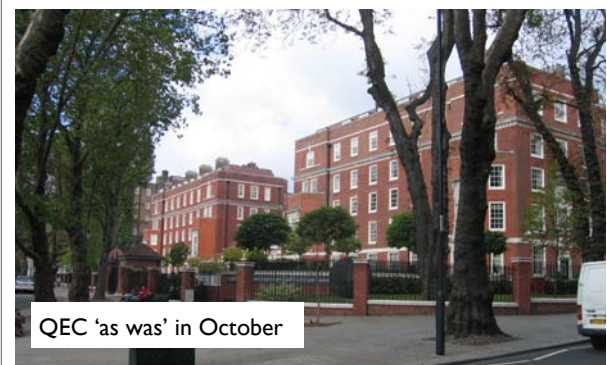
QEC 'as was' in October