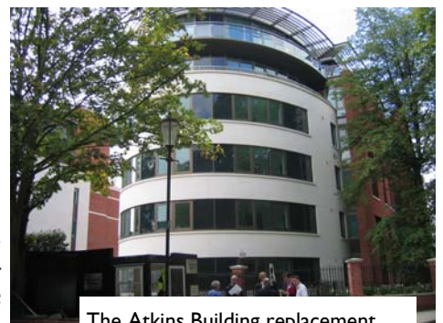
The Atkins Building replacement into flats.

Meeting them in Notting Hill let her have a brief wander round the nearby site of Queen Elizabeth College where she graduated and which is now converted into flats.