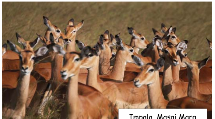
Impala, Masai Mara