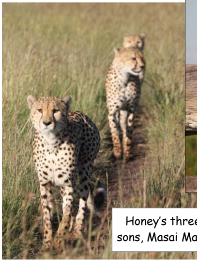
Honey's three sons, Masai Mara